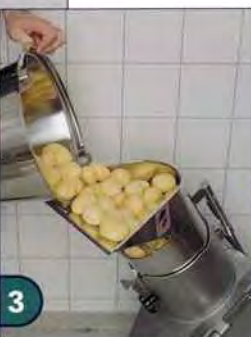
3 feed hopper