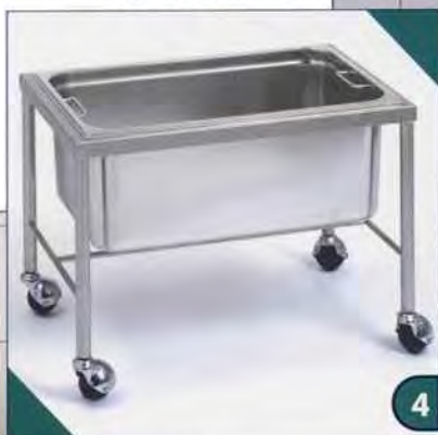
4 product collecting trolley