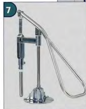
7 manually-operated push feed attachment