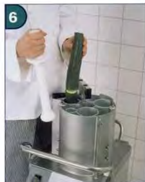
6 4-tube insert