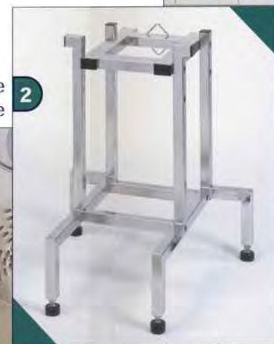
2 floor machine frame