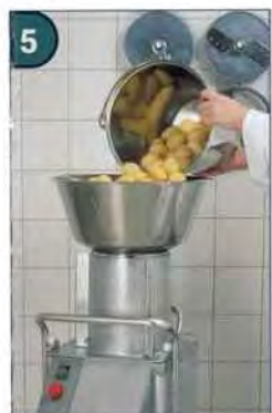
5 feed hopper